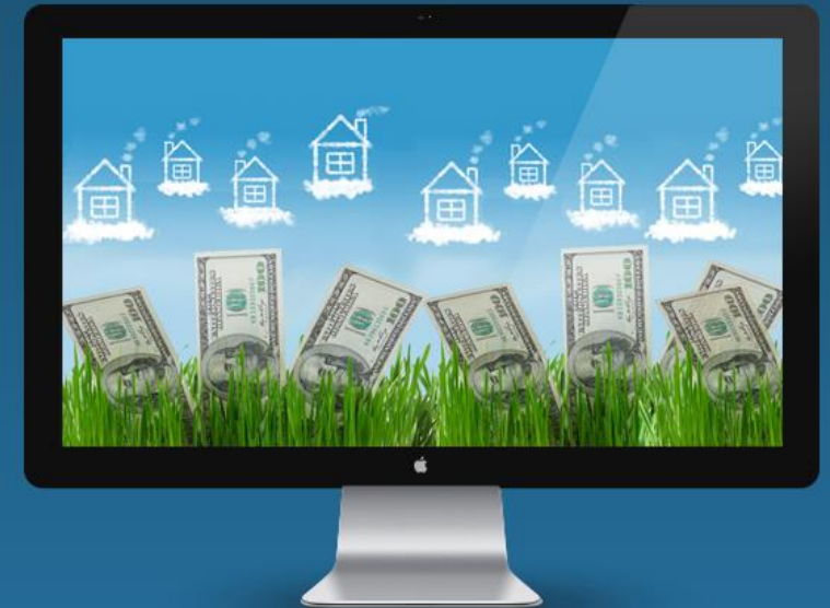
Experience the possibilities of Genesis Portal

Agents REO Professionals Real Estate Offices Team Leaders Title/Escrow Companies Lender/Mortgage Professionals Asset Managers/Outsourcers Hedge Funds/Serviceers Contractors Buyers Sellers