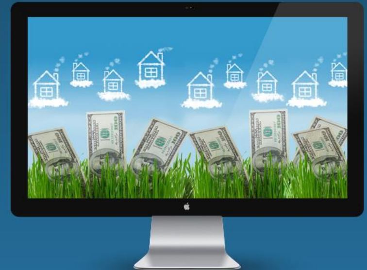
Experience the possibilities of Genesis Portal

Agents REO Professionals Real Estate Offices Team Leaders Title/Escrow Companies Lender/Mortgage Professionals Asset Managers/Outsourcers Hedge Funds/Serviceers Contractors Buyers Sellers