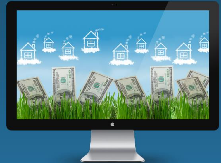
Experience the possibilities of Genesis Portal

Agents REO Professionals Real Estate Offices Team Leaders Title/Escrow Companies Lender/Mortgage Professionals Asset Managers/Outsourcers Hedge Funds/Serviceers Contractors Buyers Sellers