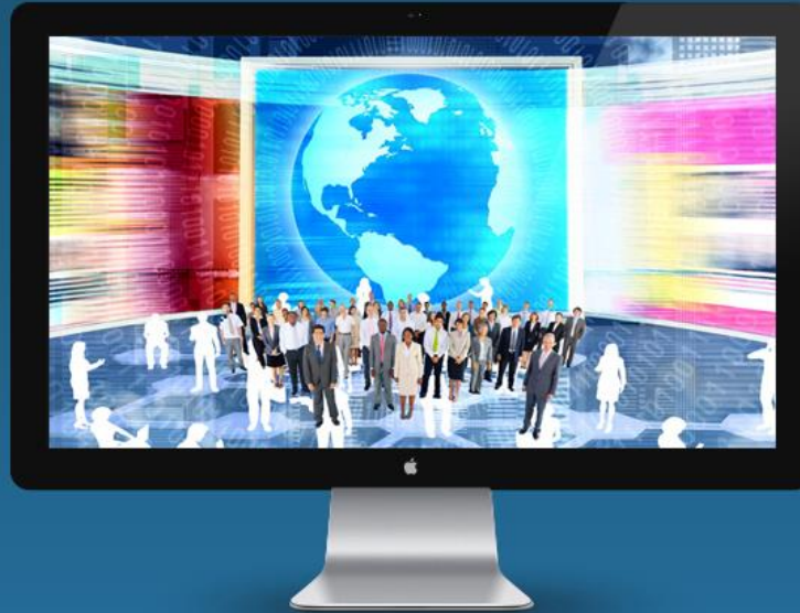
Discover RIO Agents / RIO Offices