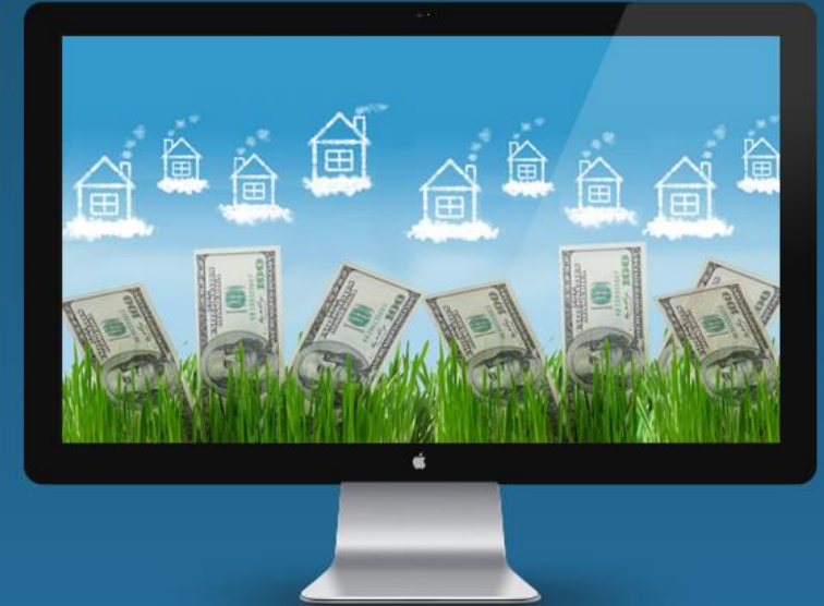
Experience the possibilities of Genesis Portal

Agents REO Professionals Real Estate Offices Team Leaders Title/Escrow Companies Lender/Mortgage Professionals Asset Managers/Outsourcers Hedge Funds/Serviceers Contractors Buyers Sellers